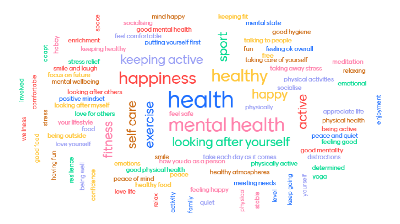
Diagram 2: "What words or sentences come to mind when you hear the term 'wellbeing?'"

The terminology used by learners had a strong focus on physical and mental health and the importance of looking after yourself. "Mental health and fitness go hand in hand, healthy body, healthy mind", and "If it's an activity you enjoy then yes, there is a link." Social aspects were important, but countered with taking time out, time for yourself and peaceful spaces. Getting outside and 'into nature' was a common theme. Diagram 3 depicts a level of understanding and the connections learners made in relation to their physical state, mental health, happiness, security and motivations. Initially, learners tended to describe their wellbeing in hedonic terms e.g. feeling 'happy', 'good', and 'enjoy' – this terminology was at the forefront of their minds. When probed, some learners were able to articulate further thoughts that suggested eudemonic concepts of meaning, functionality and an understanding of what wellbeing could help them achieve. "With Covid, everyone became more aware of wellbeing and thought – 'I haven't been out for a walk today – I must go out for a walk'. Lockdown taught me you need to have that balance."