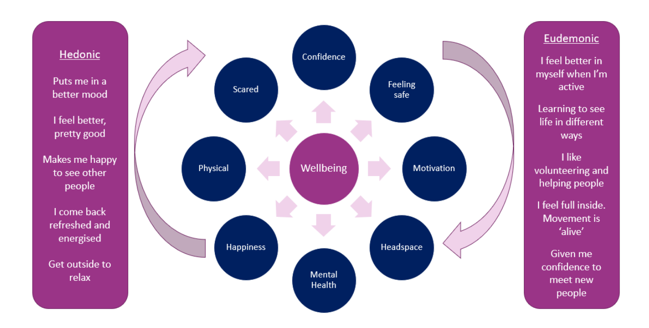
Diagram 3: Learners' knowledge and awareness of wellbeing and descriptors

We found there was less familiarity with the term 'active wellbeing' as used in the strategy: "Not familiar with the term 'active wellbeing', but 'wellbeing', yes, through college and therapy". One learner had a slightly different interpretation of the word 'active' as being more 'continuous': They described wellbeing as "looking after self and making sure you are well. If you're not right in yourself then how can you look out for others and your family? Sometimes need time out to refresh. Active wellbeing is continually doing that on a regular basis". More frequent communication from colleges using this language may help increase awareness and assist with future measurement of 'active wellbeing' provision, and this is discussed further below.